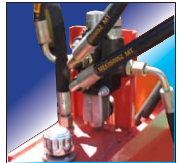
4-way Hyd. Valve