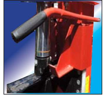
Simple lever operation