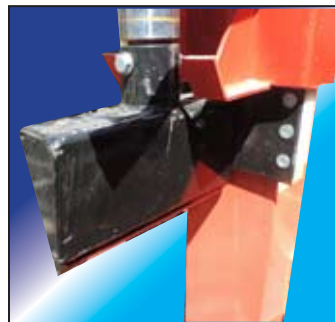
Splits logs up to 8 x 24"