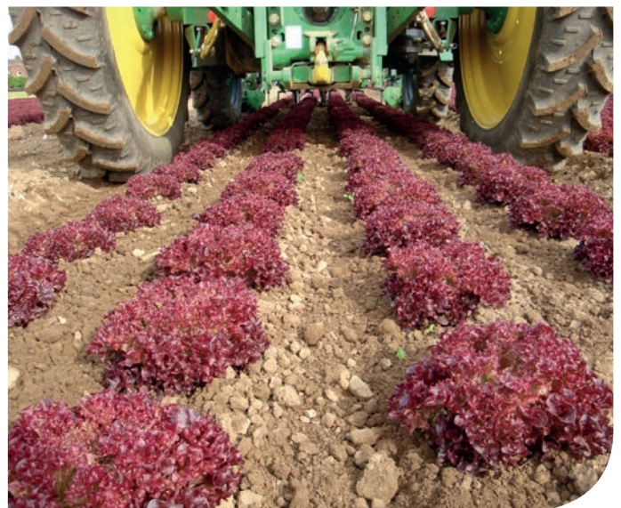
Robocrop InRow can be switched instantly between Green, Red and Infra-red colour modes.

Each camera can view a crop area of up to 2mtr wide. If wider working widths are to be accommodated then more cameras are mounted. Currently a maximum of 6mtrs is practical.