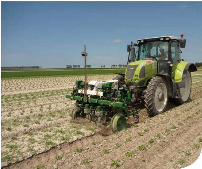
The InRow Rotors cultivate between the plants and conventional hoe tines complete the job inter row.