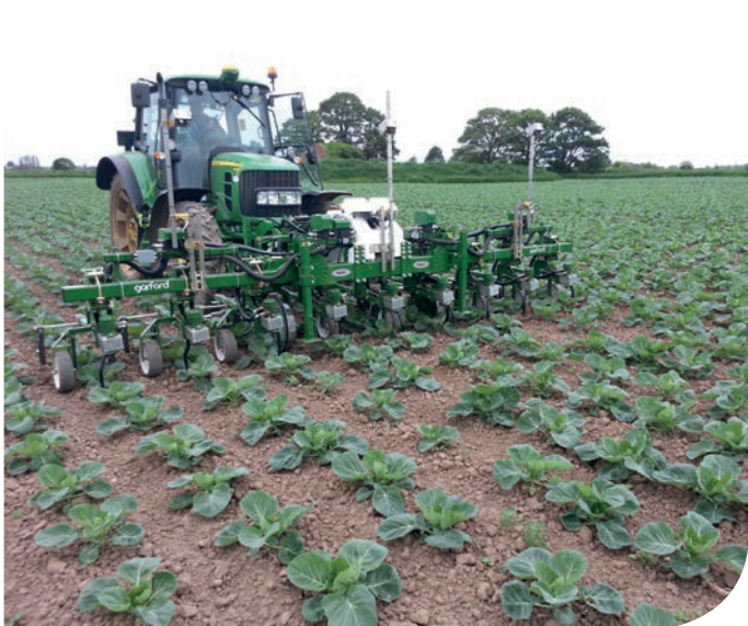
Robocrop InRow can continue to function even if some plants have grown into one another however for good reliable operation good plant separation is important