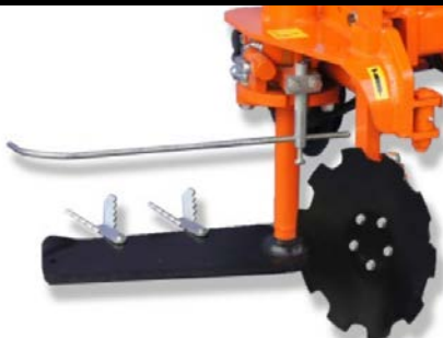
(two blade sizes - 20" and 27")