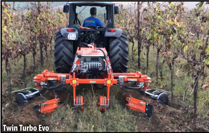
Twin Turbo Evo