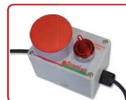
Electro-hydraulic safety control with push button over ride