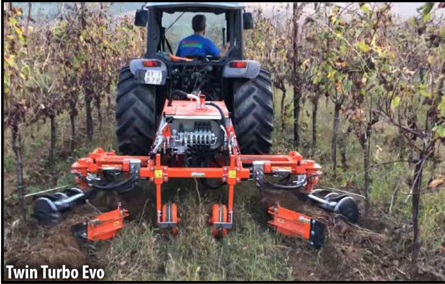
Twin Turbo Evo