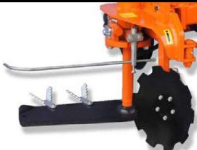
(two blade sizes - 20" and 27")