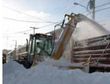
INDUSTRIAL, FULL FLIGHT AUGER