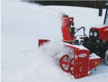
PRONOVOST GROUPS I, II AND III