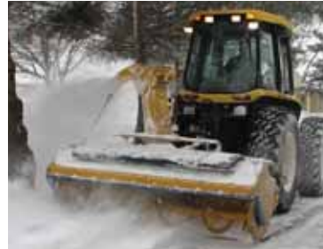
PXPL / X-PRO