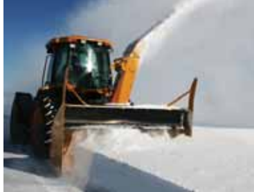
INDUSTRIAL, OPEN FLIGHT AUGER (PGV)