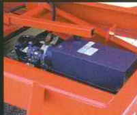
P-510-PHE and P-516-PHE Electric hydraulic pump