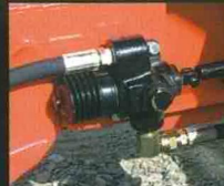
Safety feature automatic relief valve stopping cylinder action at maximum tilt P-508, P-510 and