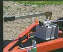
PHM-3003: Manual hydraulic pump