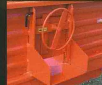
PGD: Central unloading hatch on rear panel