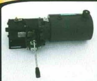
P-503-PHE Electric hydraulic pump 12V