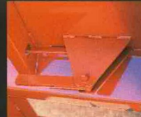
Rear panel automatic opening mechanism