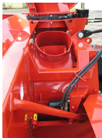
ROTARY DRUM (TRC)