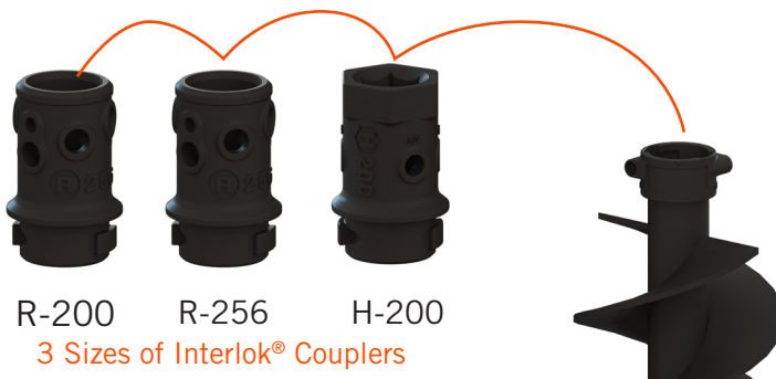
R-200 R-256 H-200