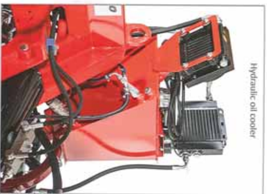
Hydraulic oil cooler