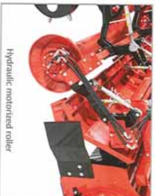
Hydraulic motorized roller