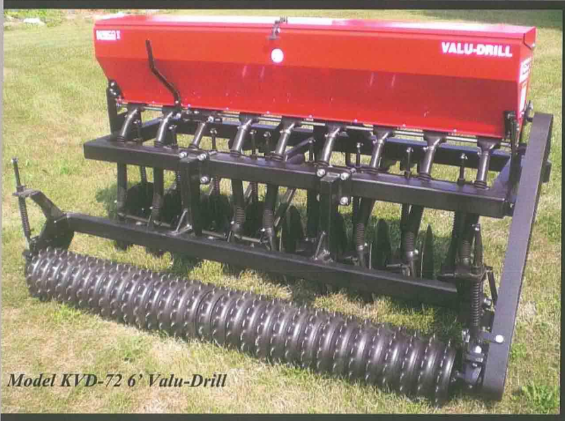
Model KVD-72 6' Valu-Drill

For Those Who Want a Simple, Rugged Drill with Extra Value, the Valu-Drill is the Perfect Choice.