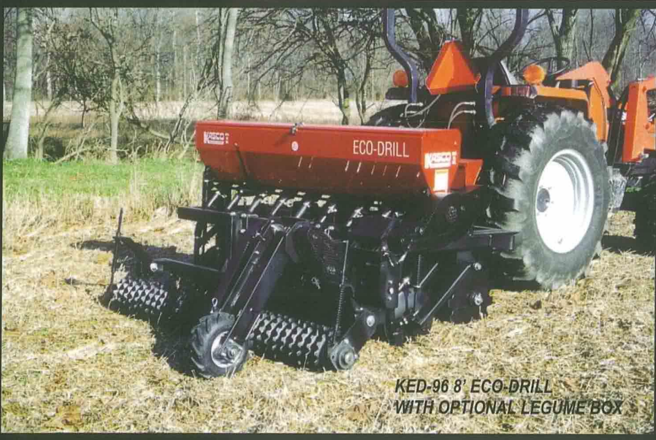
KED-96 8' ECO-DRILL WITH OPTIONAL LEGUME BOX

16" Straight Coulters slice the ground, followed by 13" Concave Openers to form a Seedbed Trench.