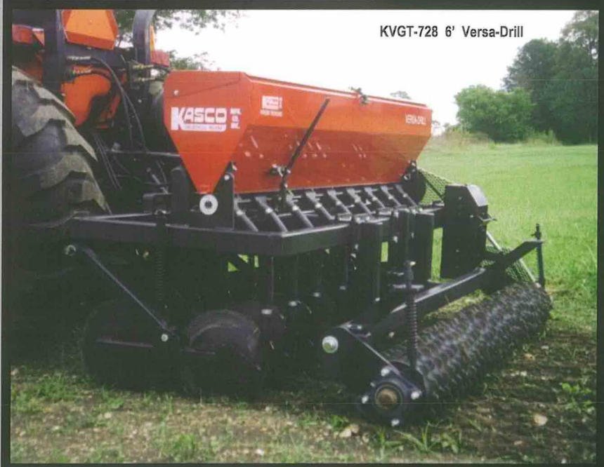
KVGT-728 6' Versa-Drill