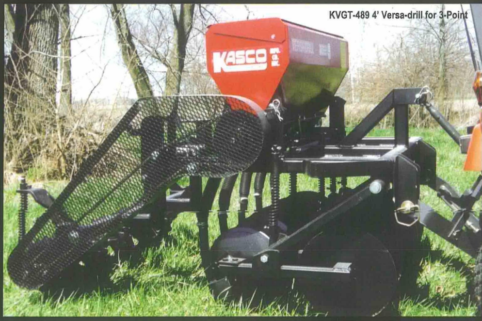
KVGT-489 4' Versa-drill for 3-Point

Ideal for use behind ATVs or smaller tractors, THE VERSA-DRILL offers unique "Walking Beam" engineering. This design allows the Drill to follow the terrain, even the most uneven, rocky, no-till conditions.