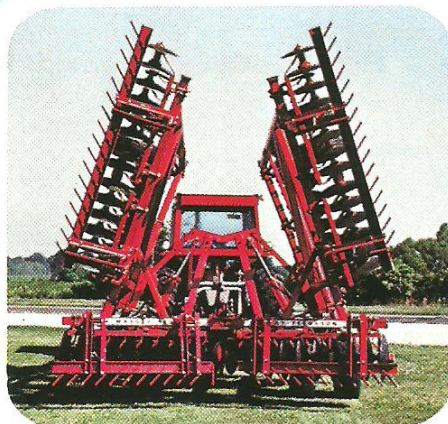
Folds with a big Massey disk for easy transport