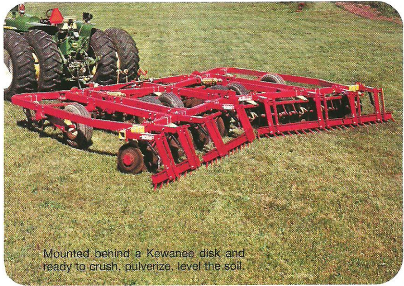
Mounted behind a Kewanee disk and ready to crush, pulverize, level the soil.