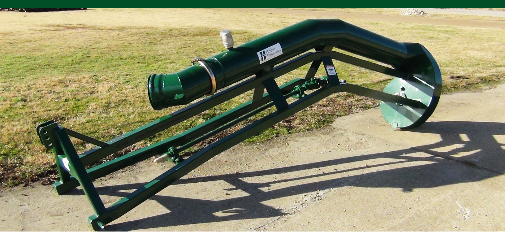
CTM & CTH Models

CD6M, CD8M, CD10M (See M-Performance Curves) CD6H, CD8H, CD10H, CD12H, CD16H (See H-Performance Curves)