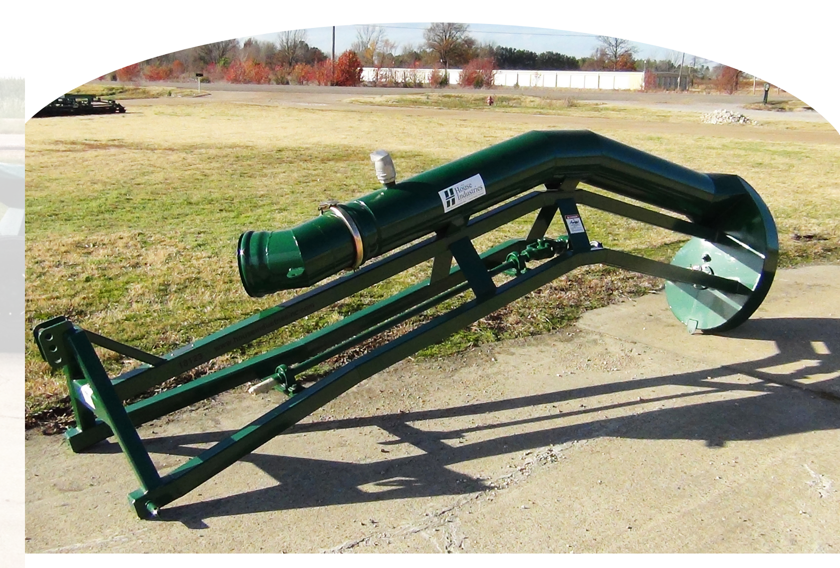
Three Point Hitch I Trailer Mounted I Hydraulic