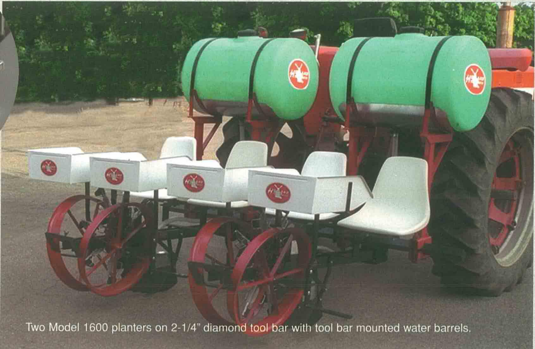
Two Model 1600 planters on 2-1/4" diamond tool bar with tool bar mounted water barrels.