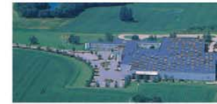
Høje Taastrup, Denmark