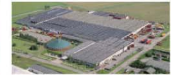
Nørre Alslev, Denmark