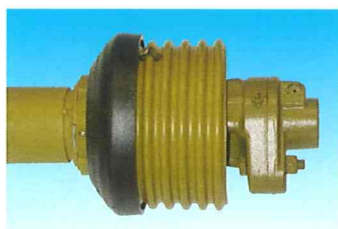
PTO shaft with shear pin (optional)