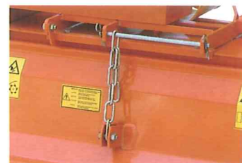
Rear door: chain