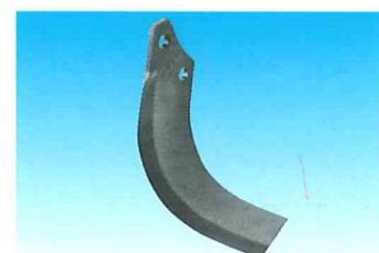
Detail of blade