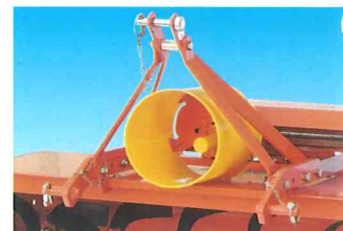
Universal three point hitch, cat. I