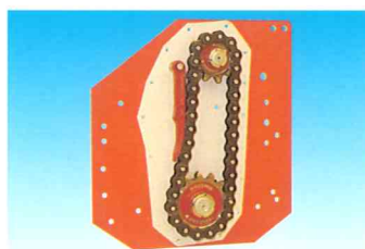
Chain side drive