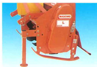
Skids for working depth adjustment