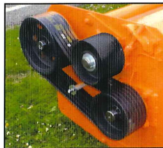
Six V-Belt Side Drive With Automatic Tensioner