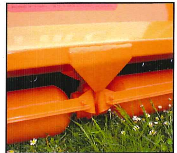
With Center Support For Enhanced Rigidity