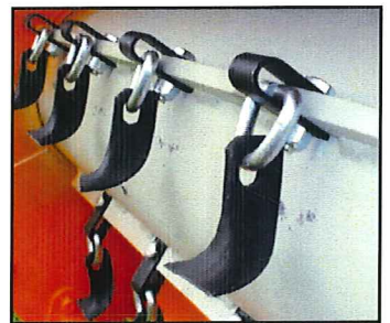
Heavy Blades are D-Ring Mounted for Quick Repair

Solex Corp. • 220 S Jefferson • Dixon, CA 95620