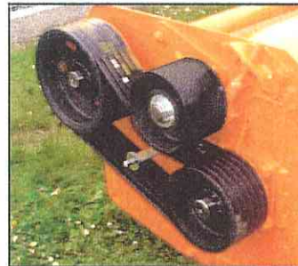
Six V-Belt Side Drive With Automatic Tensioner