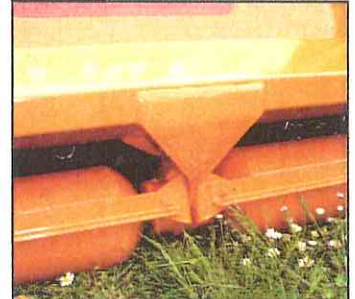
With Center Support For Enhanced Rigidity