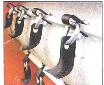
Heavy Blades are D-Ring Mounted for Quick Repair

Solex Corp. • 220 S Jefferson • Dixon, CA 95620 (707) 678-5533 • Fax: (707) 678-9788 http://www.solexcorp.com • sales@solexcorp.com