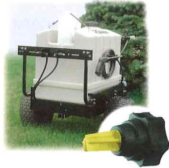
2 Nozzle Boomless Kit