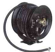
9428114 Hose reel