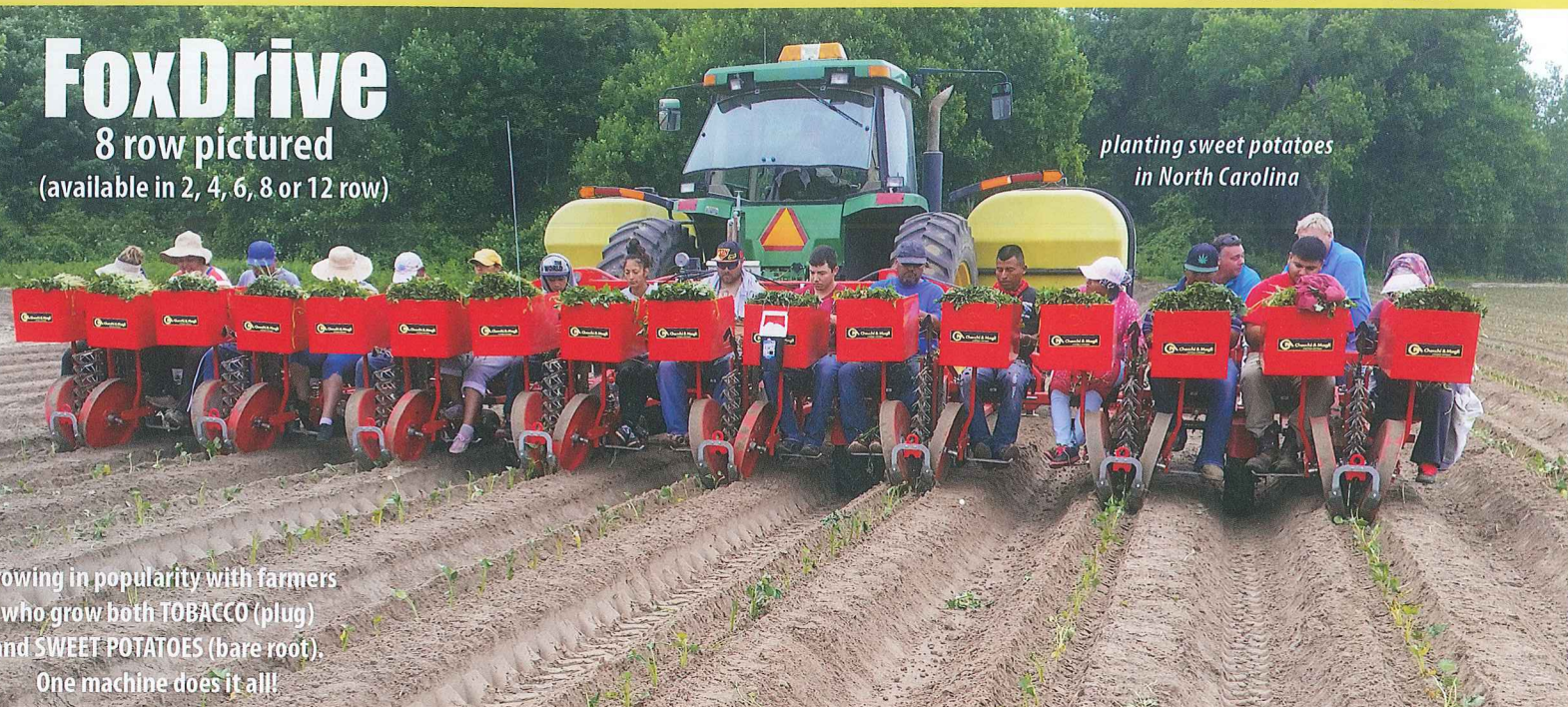
planting sweet potatoes in North Carolina

Growing in popularity with farmers who grow both TOBACCO (plug) and SWEET POTATOES (bare root). One machine does it all!