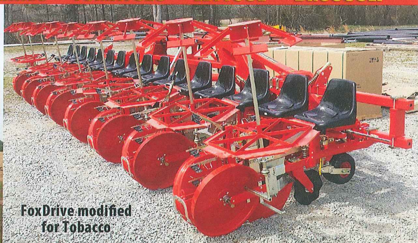
FoxDrive modified for Tobacco

8 row FoxDrive with hydraulic fold (optional) for 6, 8 or 12 rows