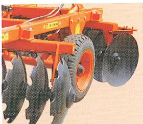
Combination of plane & notched disc