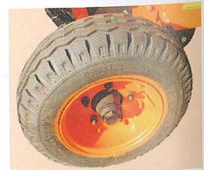
Wheel - balloon type