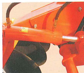
Hydraulic cylinder with 4 ton capacity