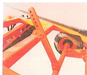
Tyre locking system