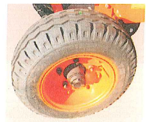
Wider tubeless tyre (optional) 10: 0/75-15.3