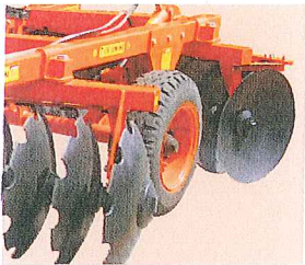
Combination of plane & notched disc