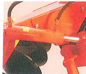
Hydraulic cylinder with 4 ton capacity